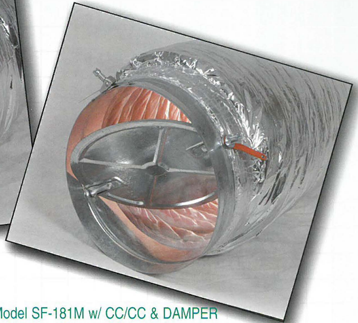
Model SF-181M w/ CC/CC & DAMPER

DESCRIPTION - CASCO Model SF-181M is a fully insulated, Class 1, U.L. listed Air Duct. This versatile product is designed for low pressure commercial, industrial and residential applications where sound attenuation is important. Complete acoustical test report available upon request (ADC Test Code FD 72-R1).