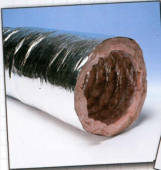
Model # 2PMJ