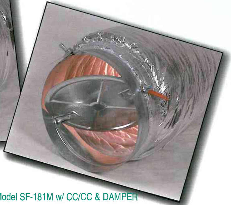
Model SF-181M w/ CC/CC & DAMPER

DESCRIPTION - CASCO Model SF-181M is a fully insulated, Class 1, U.L. listed Air Duct. This versatile product is designed for low pressure commercial, industrial and residential applications where sound attenuation is important. Complete acoustical test report available upon request (ADC Test Code FD 72-R1).